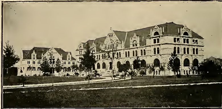
A View of the Campus.